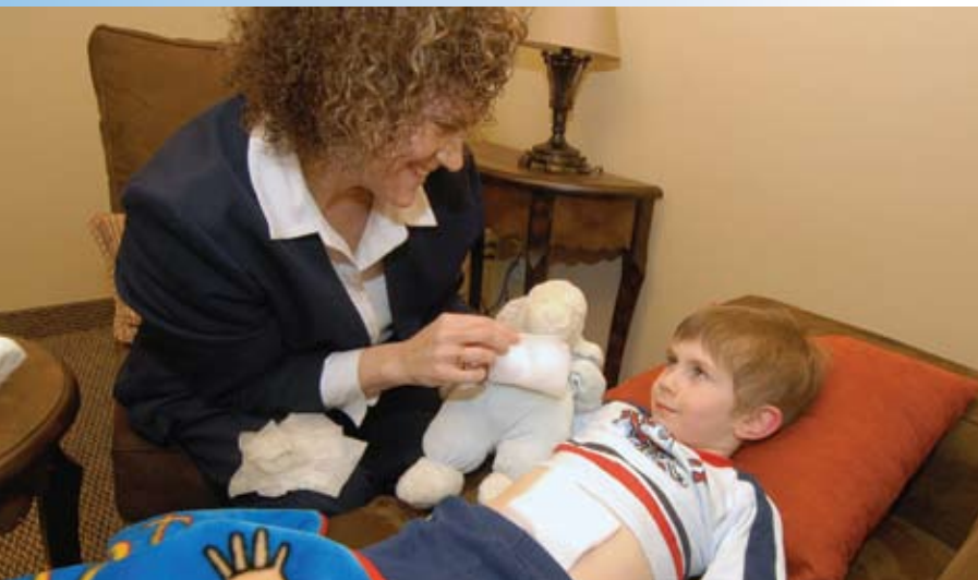
Assist a child along the road to recovery