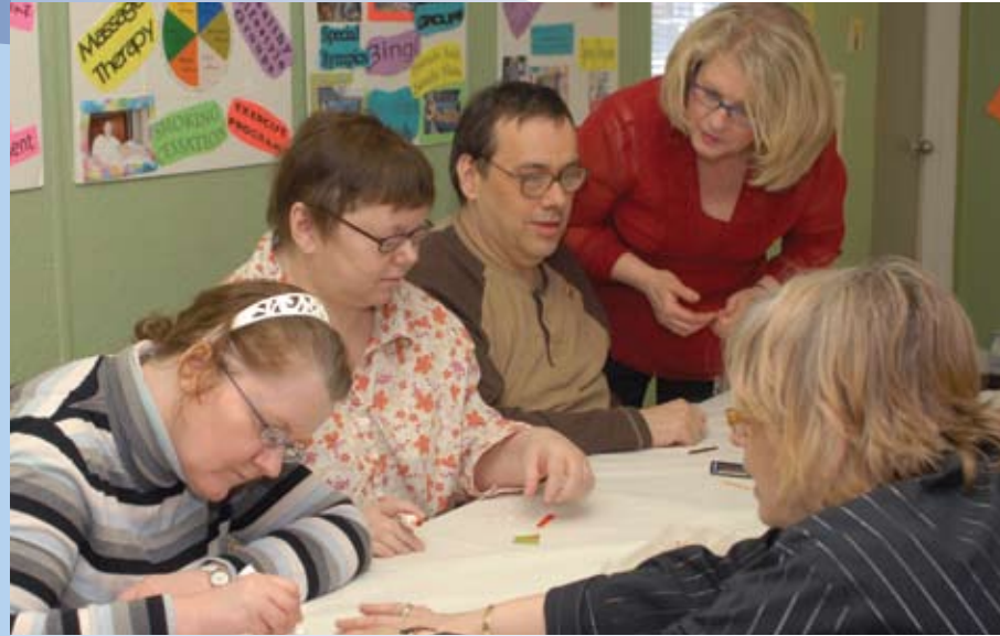
Support individuals with disabilities to help them enhance their well-being.