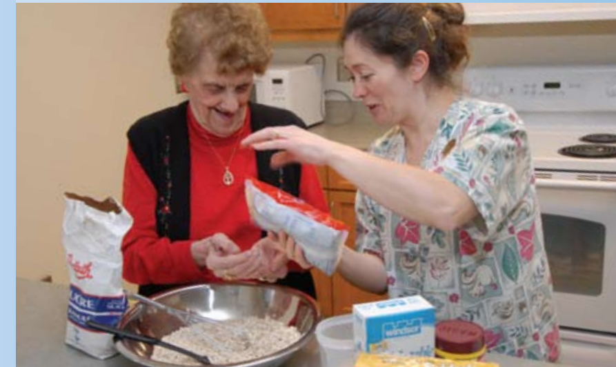
Help a senior enjoy greater independence